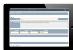
Logs & Reports